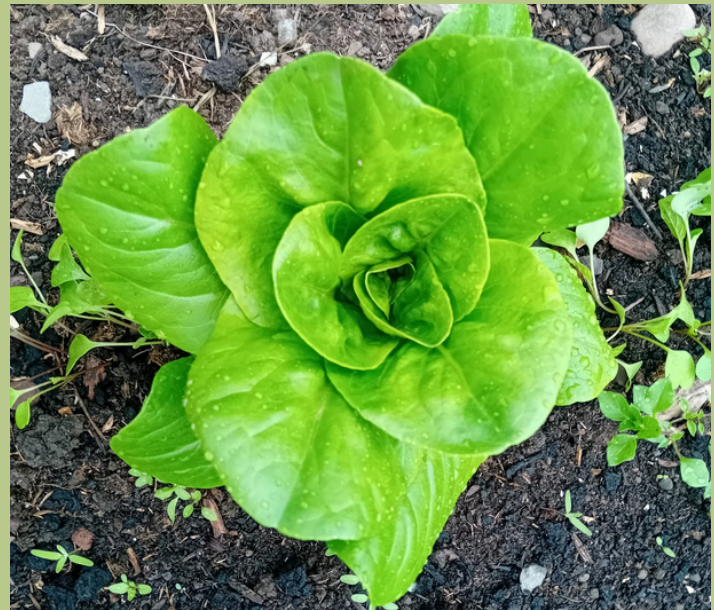
Our Beautiful Butterhead Lettuce

George also shared a quick update from the OST garden: despite some of the purple sprouting broccoli and spring onions bolting (it happens to the best of us!), work is in full swing with Kirsten getting the tomatoes sorted.