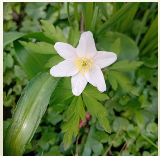
Wood anemone ( Anemone nemorosa ).