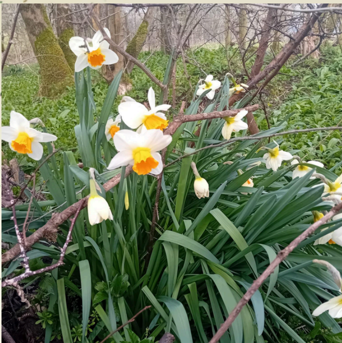
A host of golden daffodils...